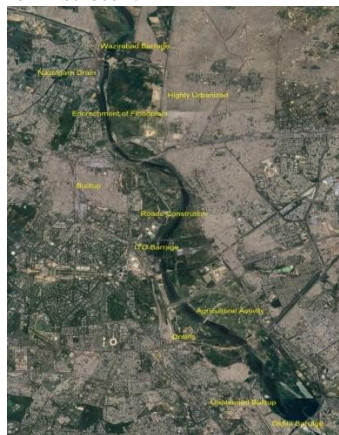
Fig. 1. The river Delhi stretch of Yamuna flowing through densely populated area